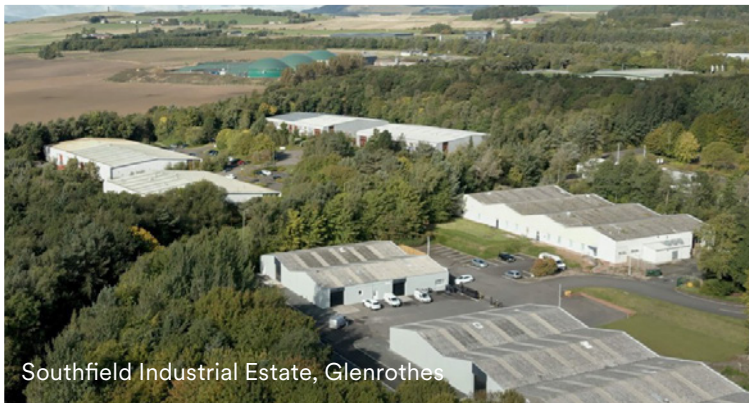
Southfield Industrial Estate, Glenrothes