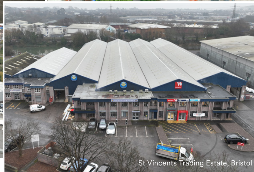
St Vincents Trading Estate, Bristol