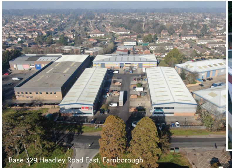
Base 329 Headley Road East, Farnborough