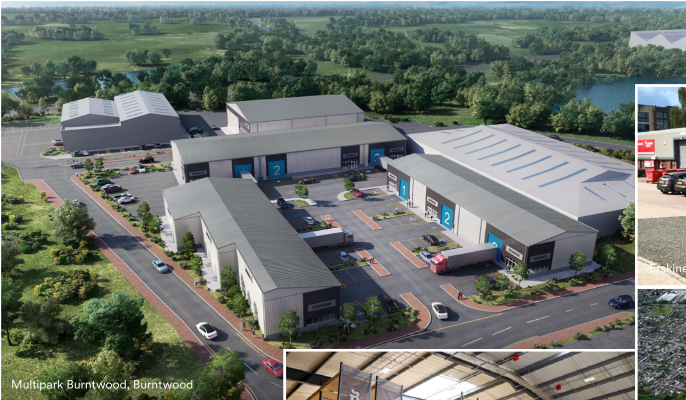
Multipark Burntwood, Burntwood