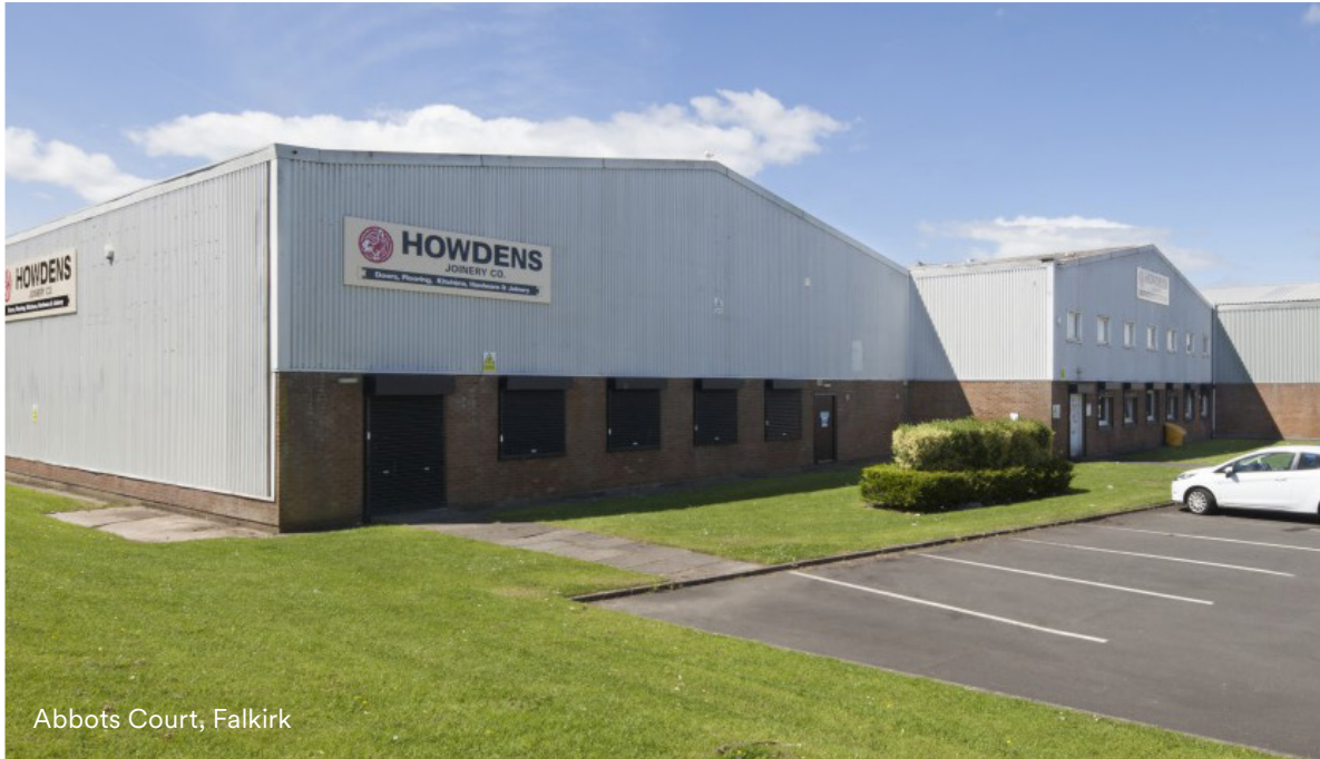
Abbots Court, Falkirk