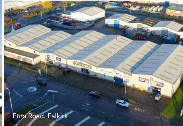
Etna Road, Falkirk