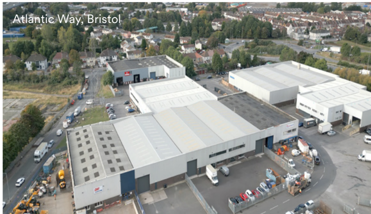
Atlantic Way, Bristol