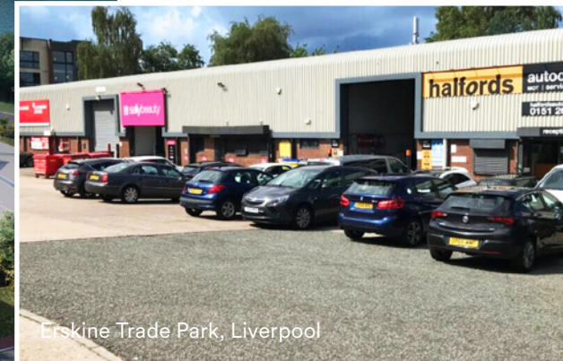
Erskine Trade Park, Liverpool