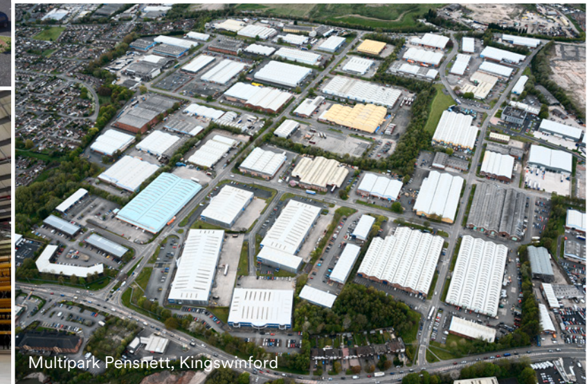
Multipark Pensnett, Kingswinford