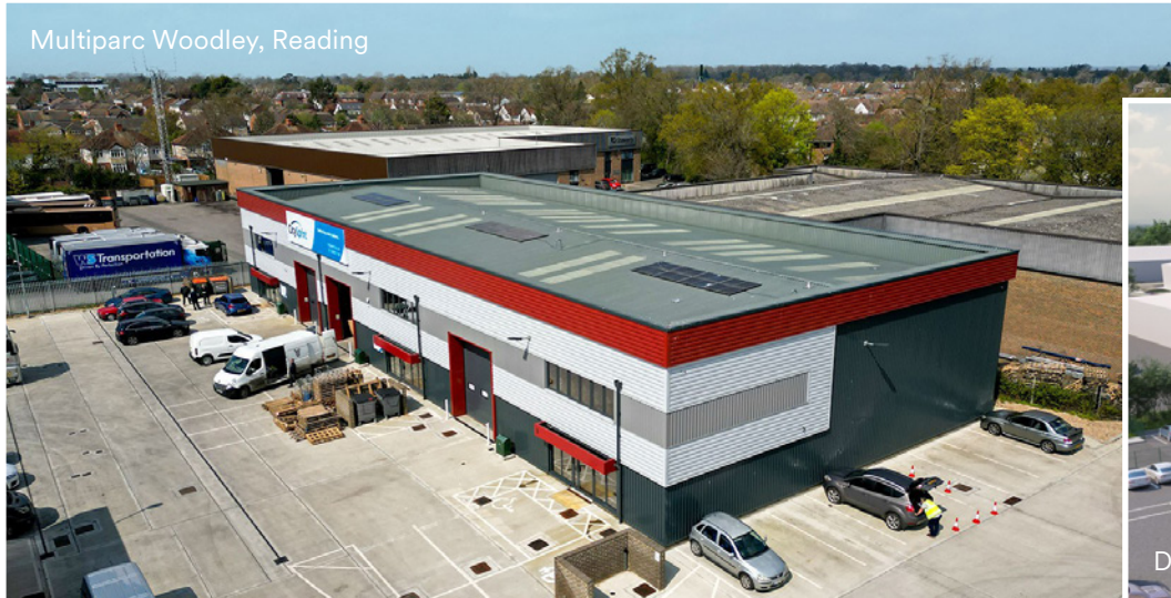
Multiparc Woodley, Reading