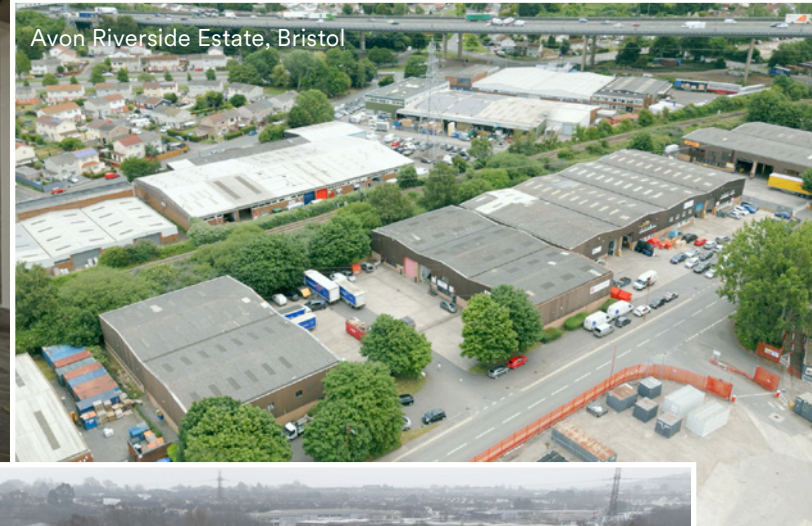
Avon Riverside Estate, Bristol