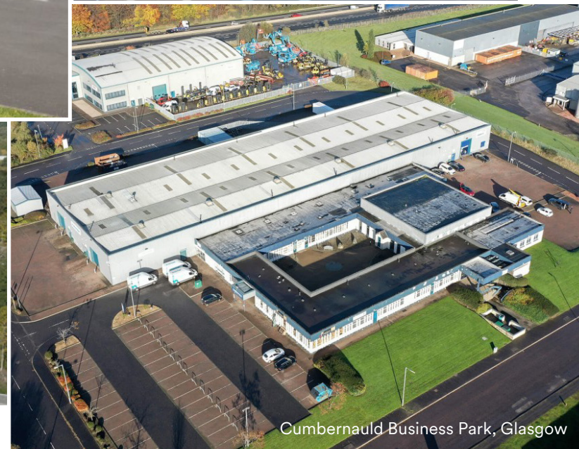
Cumbernauld Business Park, Glasgow