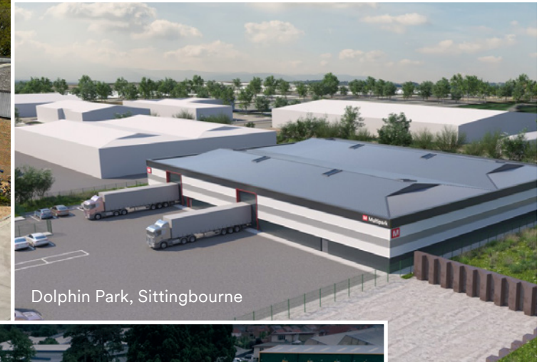
Dolphin Park, Sittingbourne