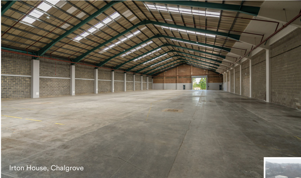
Irton House, Chalgrove