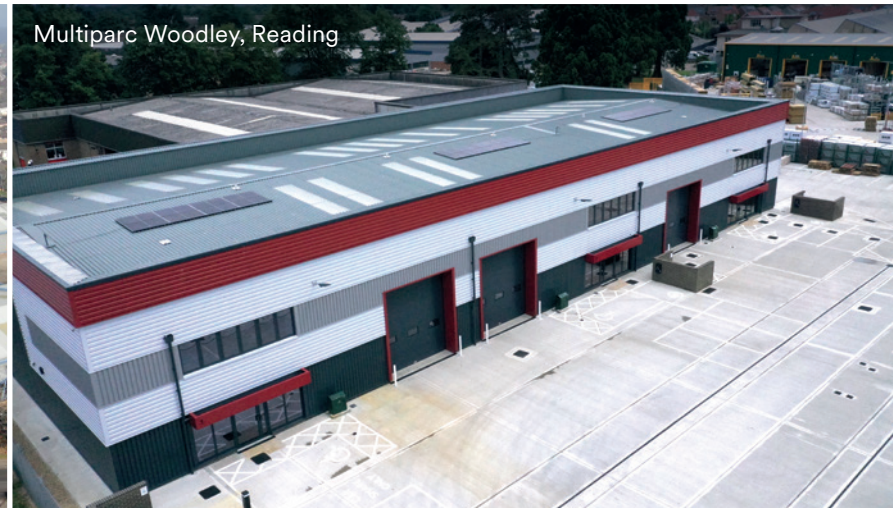
Multiparc Woodley, Reading